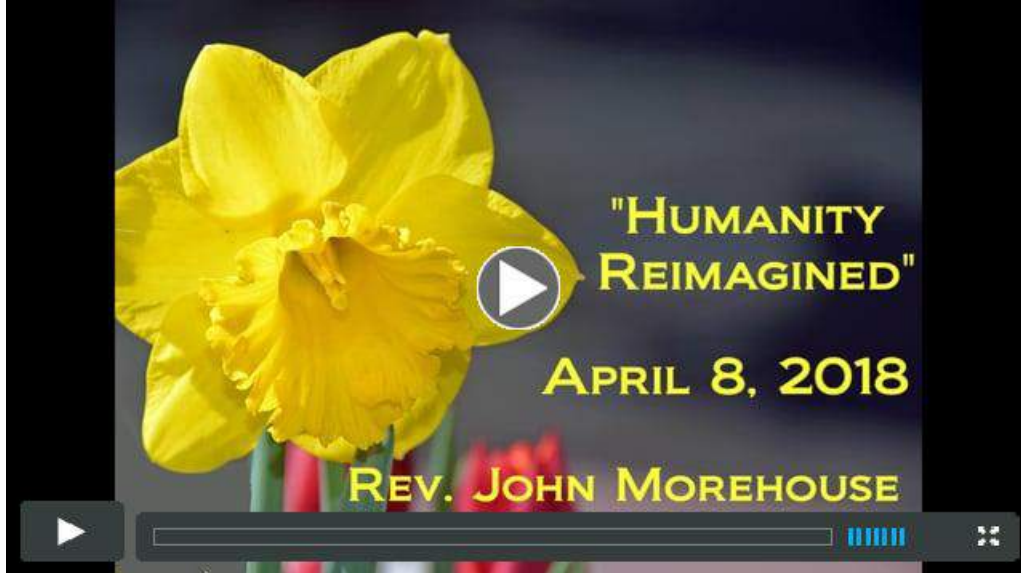
"Humanity Reimagined"~ April 8, 2018