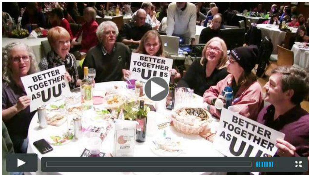
Better Together #3

And Upcoming First Tuesday Family Ministry: May 1st - 7:00-8:00 pm