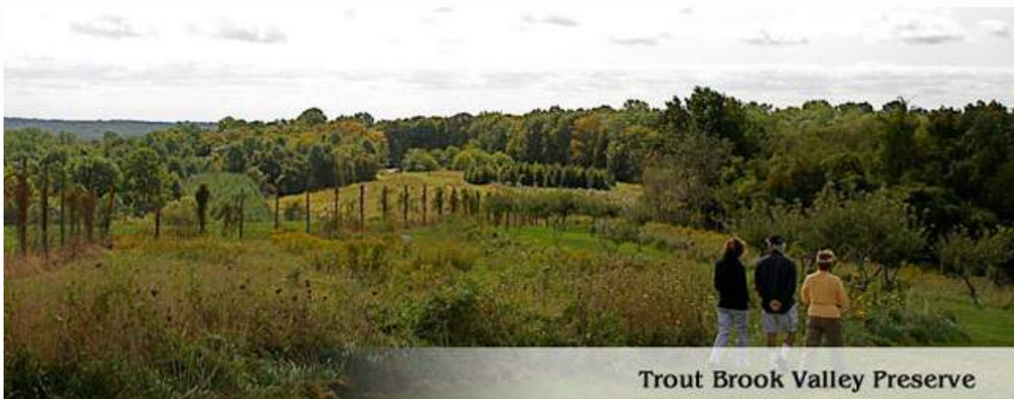
Trout Brook Valley Preserve