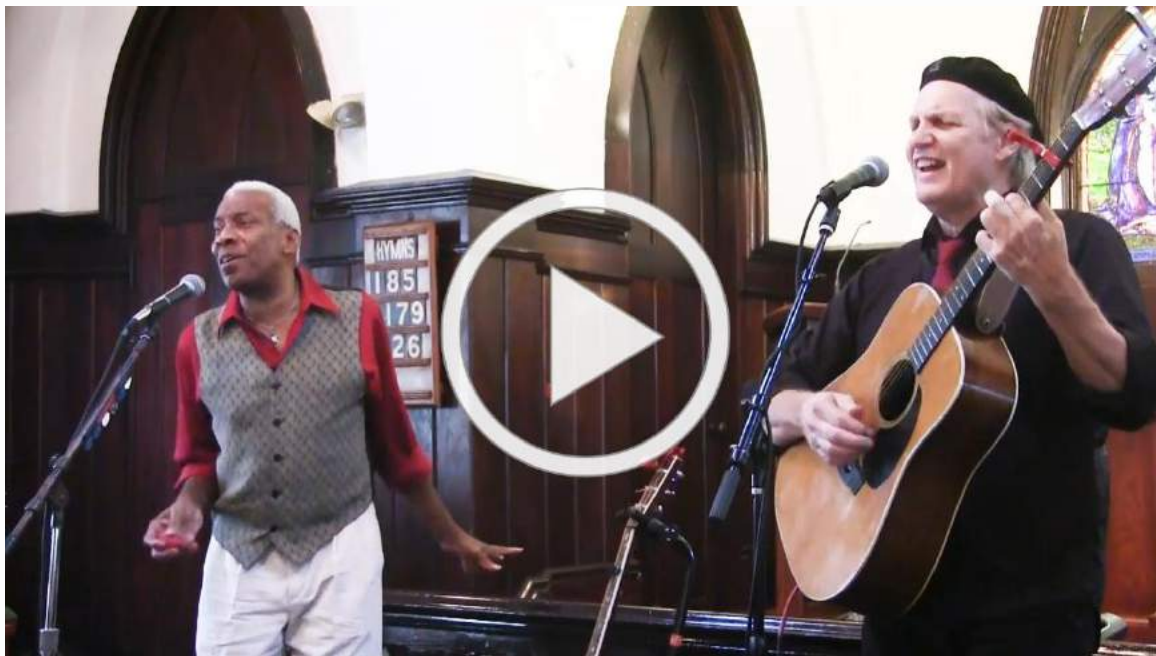
"The Skin I'm In"

Unitarian Church in Westport, 10 Lyons Plains Road, Westport