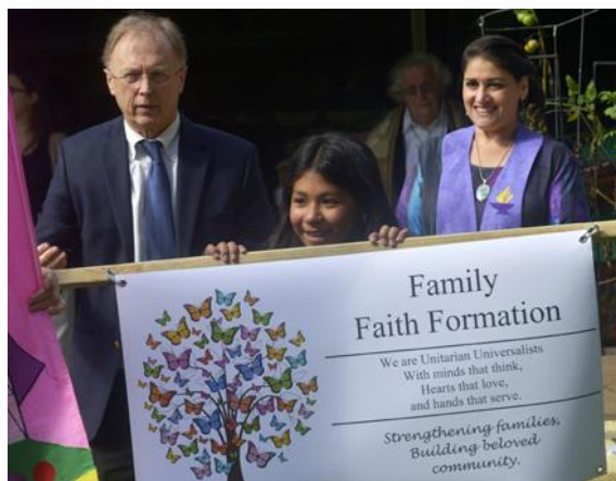
We had fun at Homecoming ...