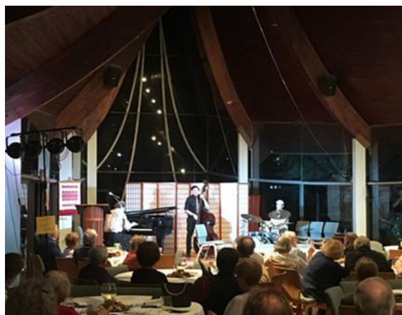
and the Clam-paign and Jazz!

CLICK HERE for Homecoming photos - CLICK HERE for CLAM-PAIGN photos